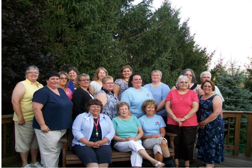
This Photo was taken at the Summer Leadership Session at Brooks BBQ 2010